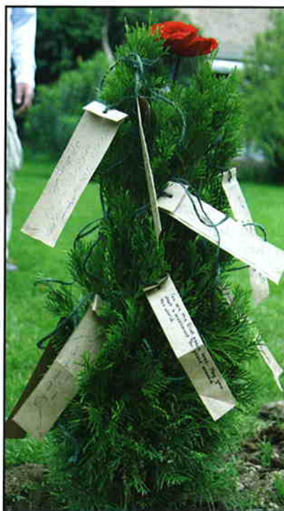
Tree planting in Tehran, Iran.