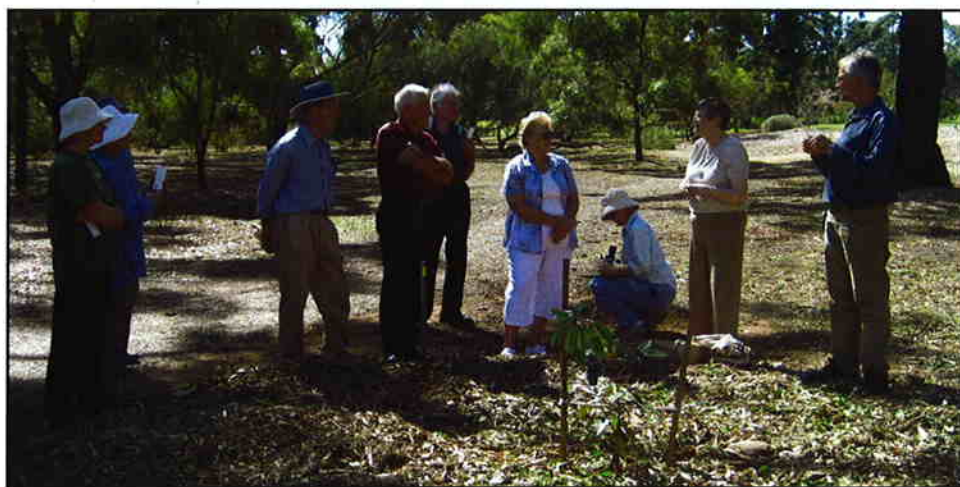
Tree planting at Waite Arboretum at the University of Adelaide (Australia).

I have started a fund at Inland Northwest Community Foundation so I can continue to plant trees even after my own death. And there will be cookies—I've provided the Foundation with my recipe so that they will continue taking cookies to each planting.